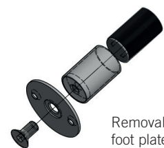
Removable foot plate